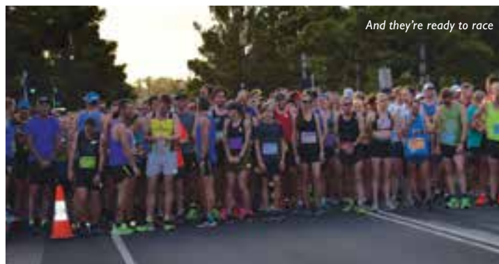
And they're ready to race

Held at the Geelong Waterfront, it was sensational to see over 400 runners partake in the 2019 Dawnbuster Fun Run. Thanks to Geelong Cross Country Club and Cardno TGM for the 5km fun run which raised over $8,000.