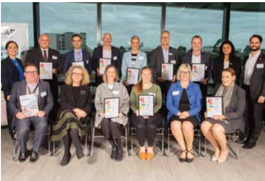
The 10 Pioneer Partner organisations

The Give Where You Live Foundation is proud to join with nine other organisations in bringing this place based Action Plan to life. Our partner organisations are: