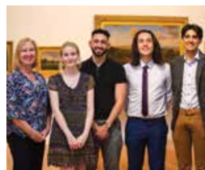
Some of Skyline's graduating students

The team has made it possible for me to strive towards tertiary education next year . I plan to study nursing and midwifery, to becoming a midwife in developing countries. Without the support of Skyline supplying books, uniforms and other resources, I couldn't fathom how I could have aimed for something like this. Thank you to all those who support and all those who make it possible, because you really are helping to make a difference ."