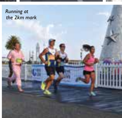
Running at the 2km mark