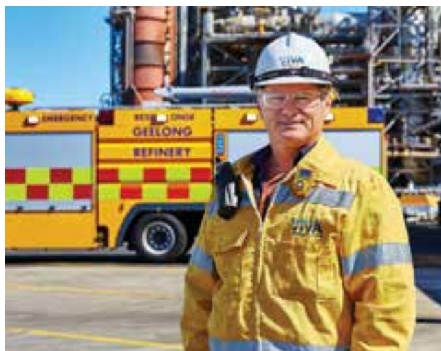
Viva Energy – a 54 year partnership

The Give Where You Live Foundation is a key community partner of the Refinery and in 2019 Viva Energy and its employees contributed over $87,000 to the Foundation. Viva Energy recognises the important work undertaken by the Foundation in addressing the complex and entrenched social issues associated with disadvantage and is proud to support the Foundation's efforts in making a difference in the community where we operate.