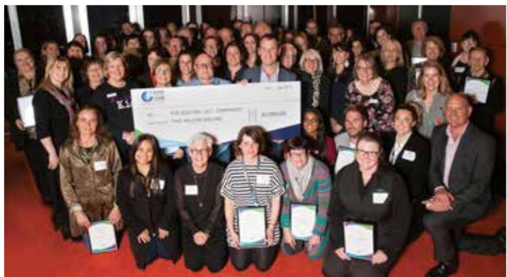
Grant Recipients with the Foundation Team

The Foundation was proud to welcome donors and partners to share the impact of their donations through the Foundation's work over the past year. Guest also shared the excitement of announcing $1.3 million in grants to fund programs and work that is now being undertaken across our community.