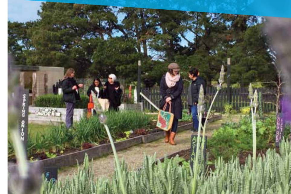
The Give Where You Live Foundation team at The Paddock

Your donations are hard at work building this success story and helping some awesome people.