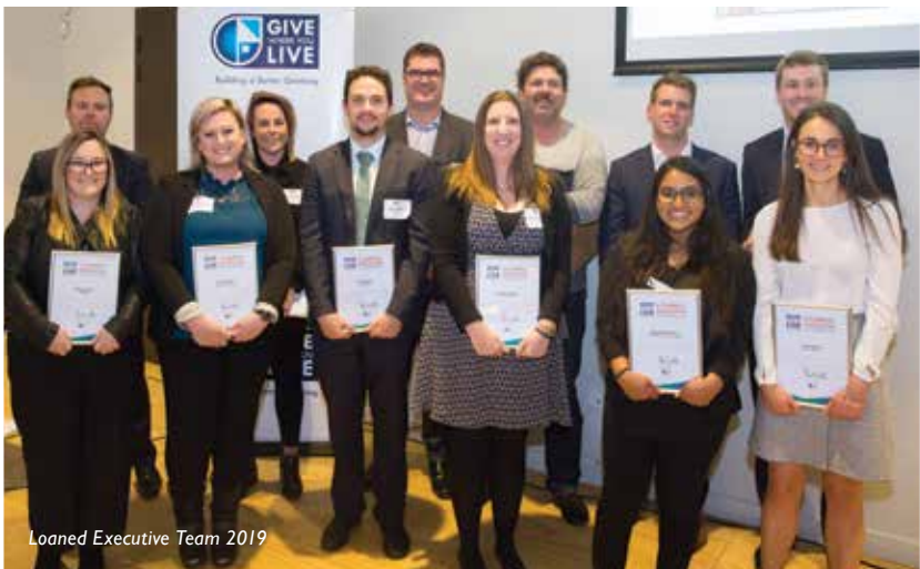
Loaned Executive Team 2019

The achievements of the 2019 Loaned Executive team were celebrated as part of the Foundation's Annual General Meeting.