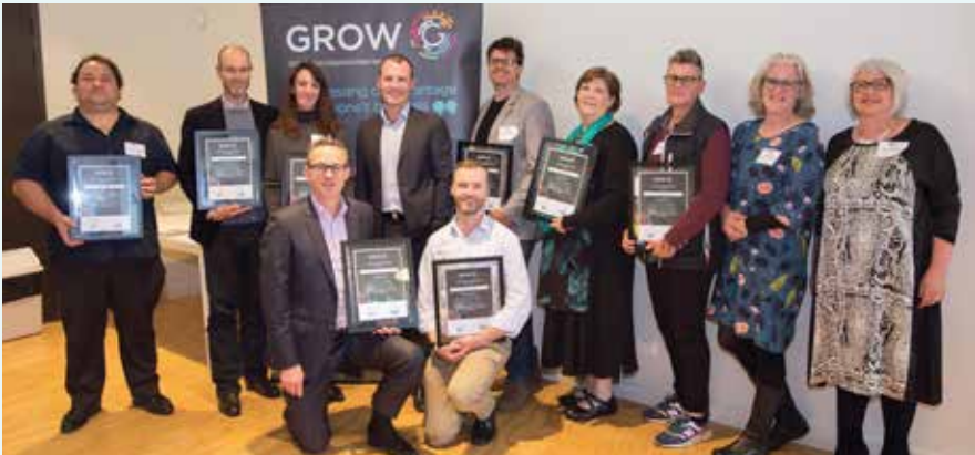
New GROW Signatories