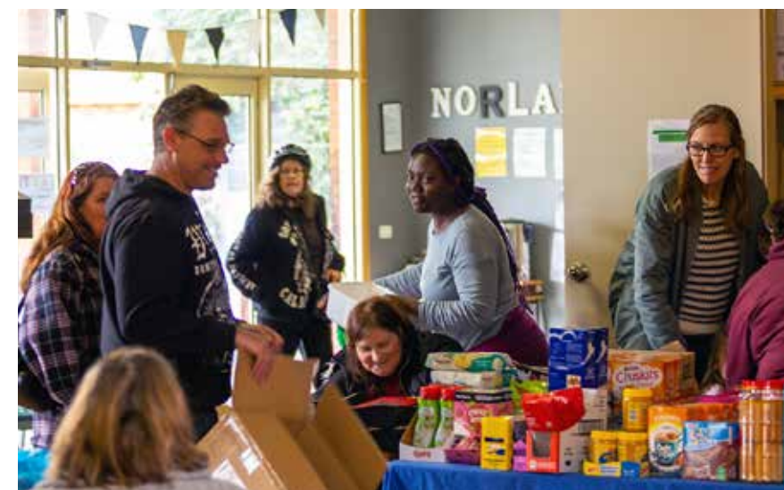
The People's Pantry