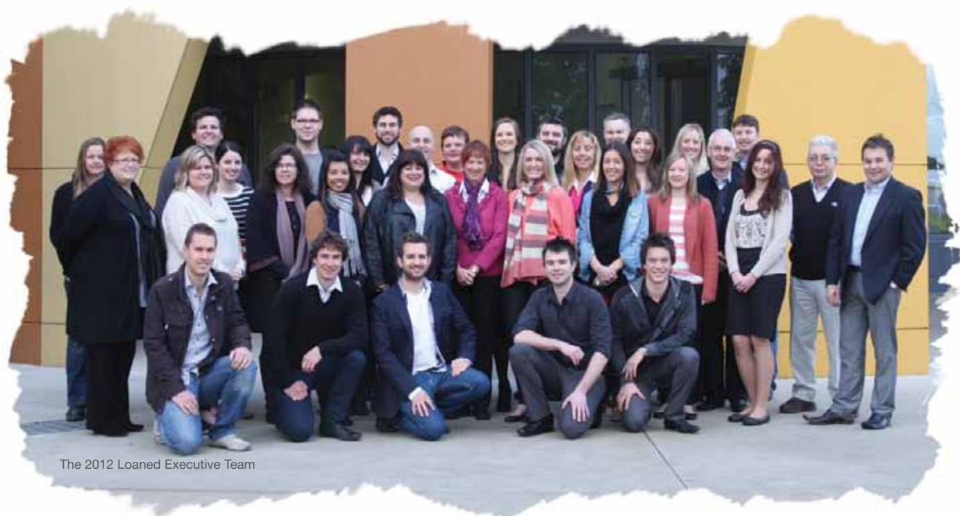
The 2012 Loaned Executive Team