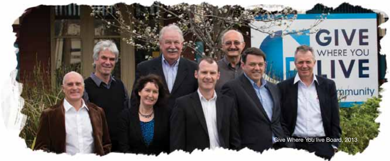
Give Where You Live Board, 2013