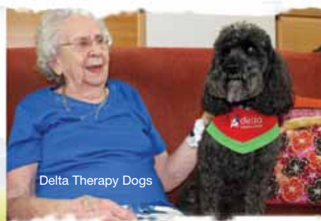
Delta Therapy Dogs