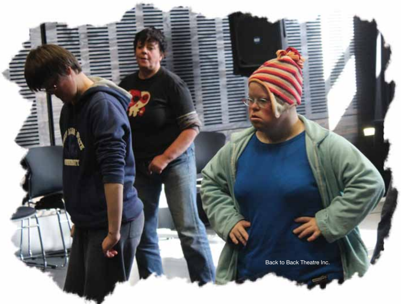
Back to Back Theatre Inc.