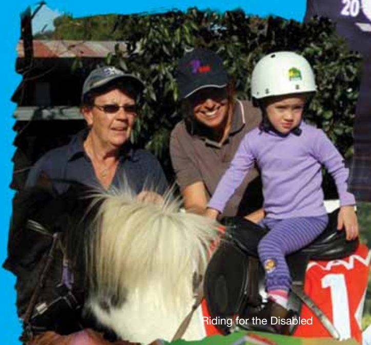
Riding for the Disabled