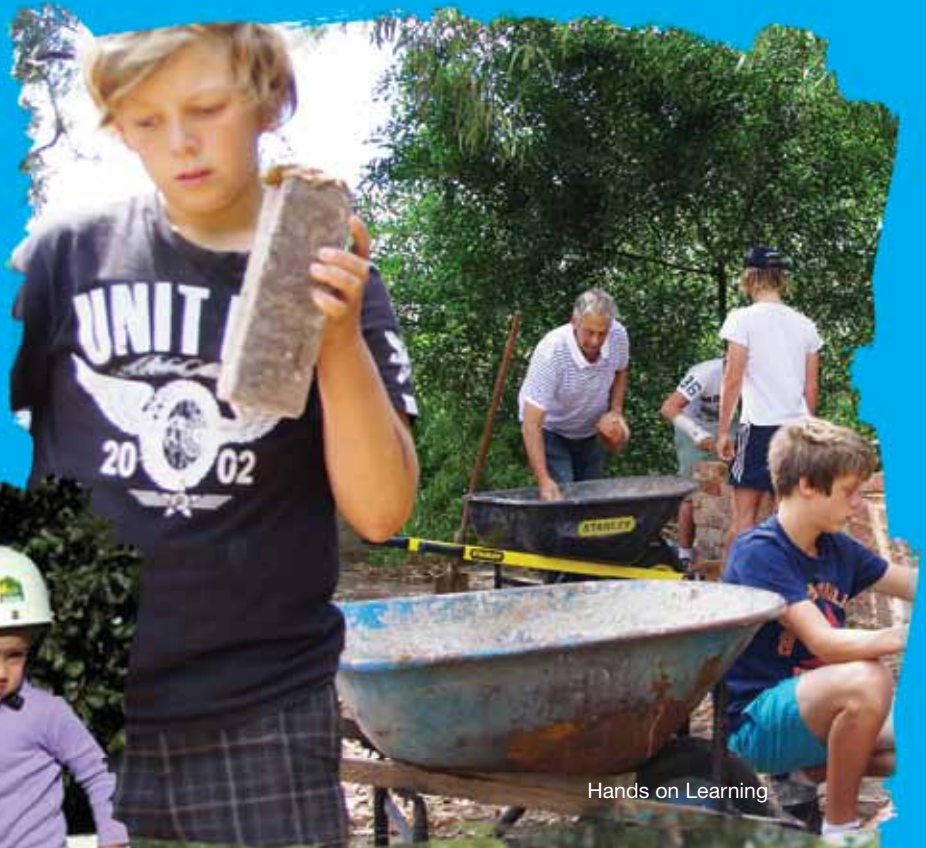
Hands on Learning